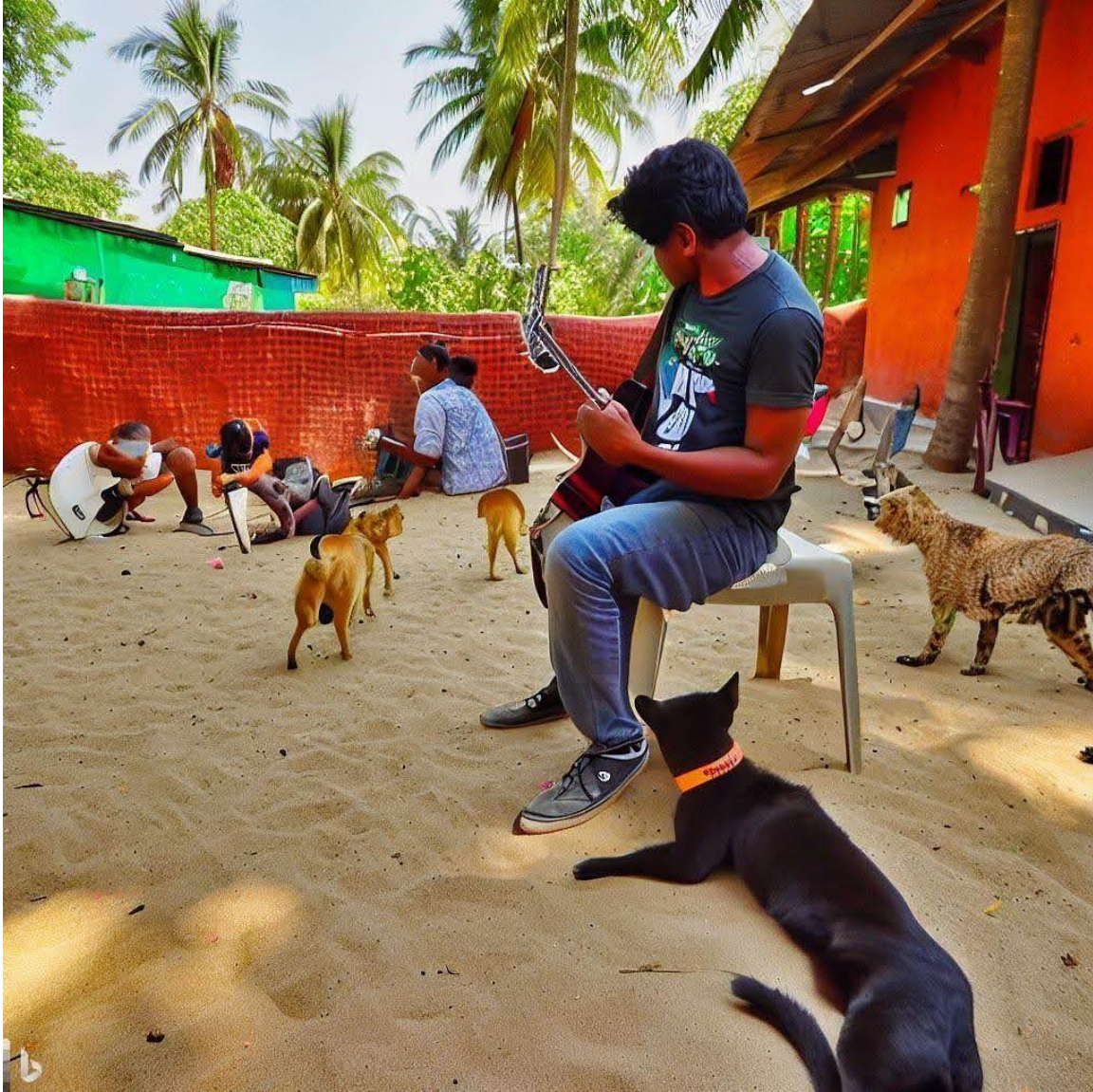
Artistic Representation of Future Facility 2