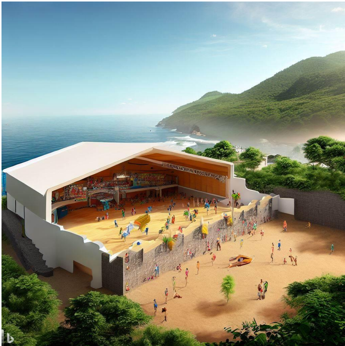
An Artist's Rendition Of Possible Future Facility With Offices, Film Theatre, And Shelter In Front, Performance Venue In Back.

Zihuatanejo and region that we hope to have all necessary funds in place after our 2026 Events.)