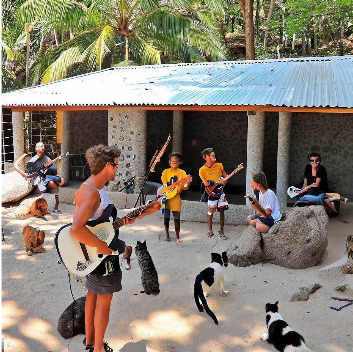
Artistic Representation of Future Facility 1